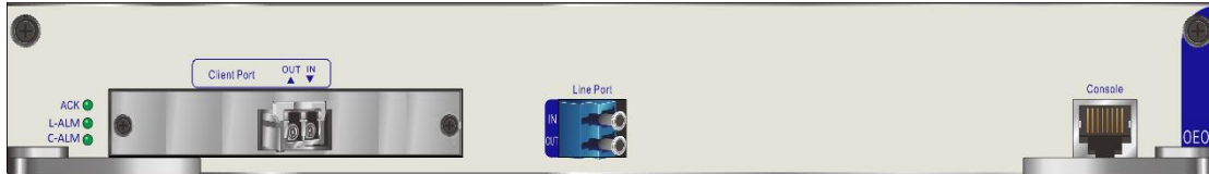
100G Transponder Card